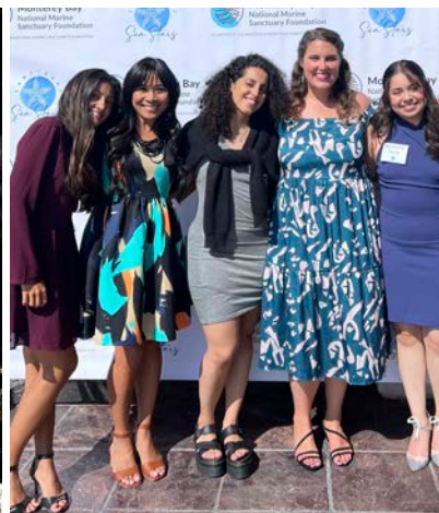
Foundation interns