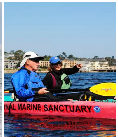
Team OCEAN in action