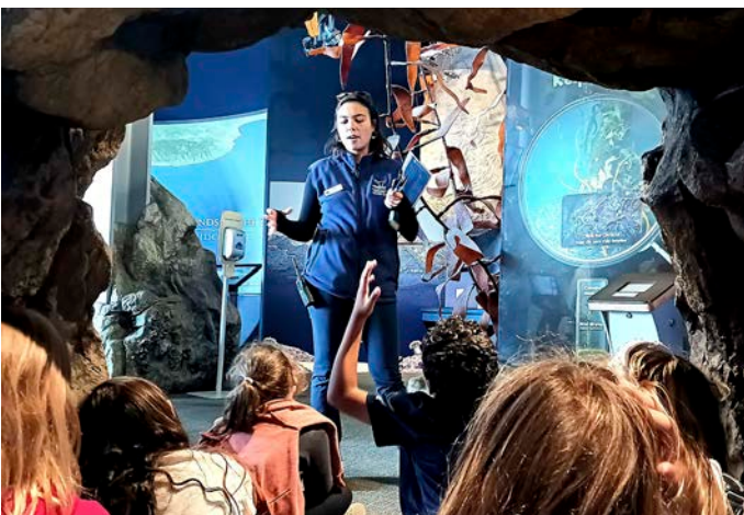
Sanctuary Exploration Center presentation