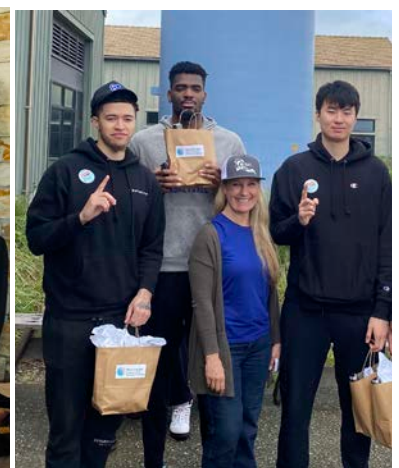
Sanctuary Warriors basketball players