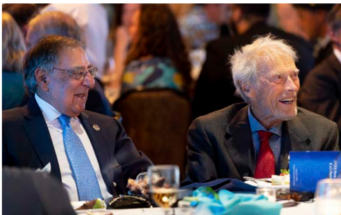
Foundation Co-Chair, Leon Panetta with Clint Eastwood at 2023 Sea Stars Celebration