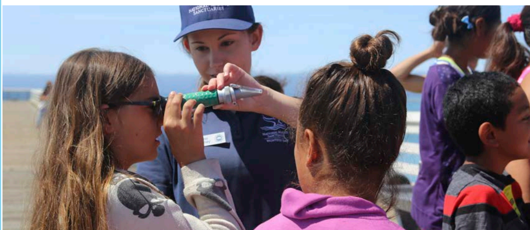
Hands-on learning during Sanctuary field trips

students participating in field trips to SEC