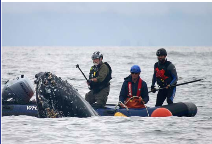
Trained rescuers disentangling a whale

Our on-going support of the Team OCEAN program plays a crucial role in protecting wildlife. This innovative program deploys trained volunteer docents directly within sanctuary's waters, where they interact with visitors and ocean-goers. These volunteers embark on kayaks, educating the public on responsible practices to safeguard sensitive wildlife, effectively preventing disturbances, and fostering a culture of respect and stewardship.